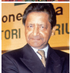
V.S. NAIPAUL Nonino International Prize 1993 Nobel Laureate in Literature 2001