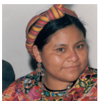
RIGOBERTA MENCHÙ Nonino Special Prize 1988 Nobel Laureate for Peace 1992