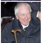
TOMAS TRANSTRÖMER Nonino International Prize 2004 Nobel Laureate in Literature 2011