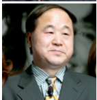
MO YAN Nonino International Prize 2005 Nobel Laureate in Literature 2012