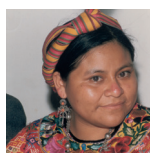
RIGOBERTA MENCHÙ Nonino Special Prize 1988 Nobel Laureate for Peace 1993

THE NONINO PRIZE HAS ANTICIPATED FIVE TIMES THE CHOICE OF THE NOBEL LAUREATES.