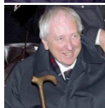
TOMAS TRANSTRÖMER Nonino International Prize 2004 Nobel Laureate in Literature 2011