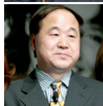
MO YAN Nonino International Prize 2005 Nobel Laureate in Literature 2012