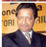
V.S. NAIPAUL Nonino International Prize 1993 Nobel Laureate in Literature 2001